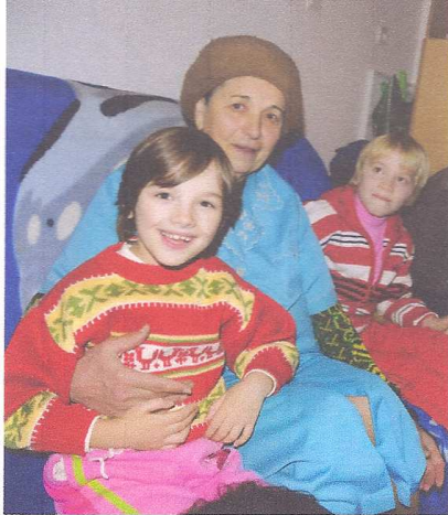
Happy Child with her Big Hearted Granny

Dear Ladies with Loving Hands in Munster,