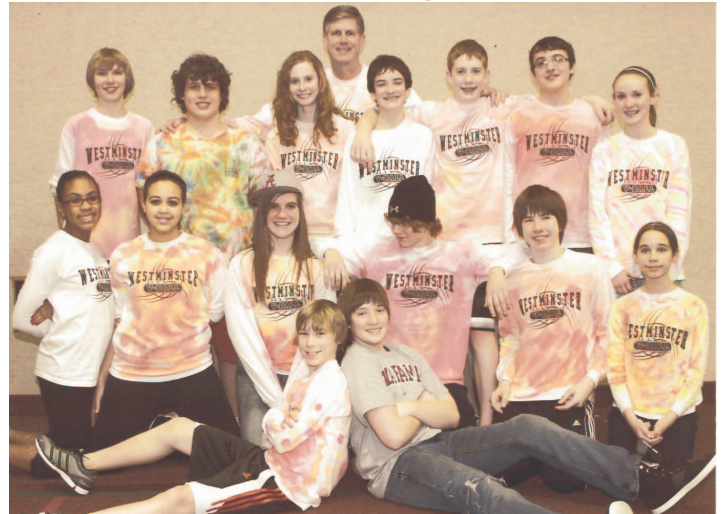
Middler Volleyball Team

The Christian Youth Volleyball League tournament was held on Saturday and Sunday, March 11 & 12. And what a tournament it was!